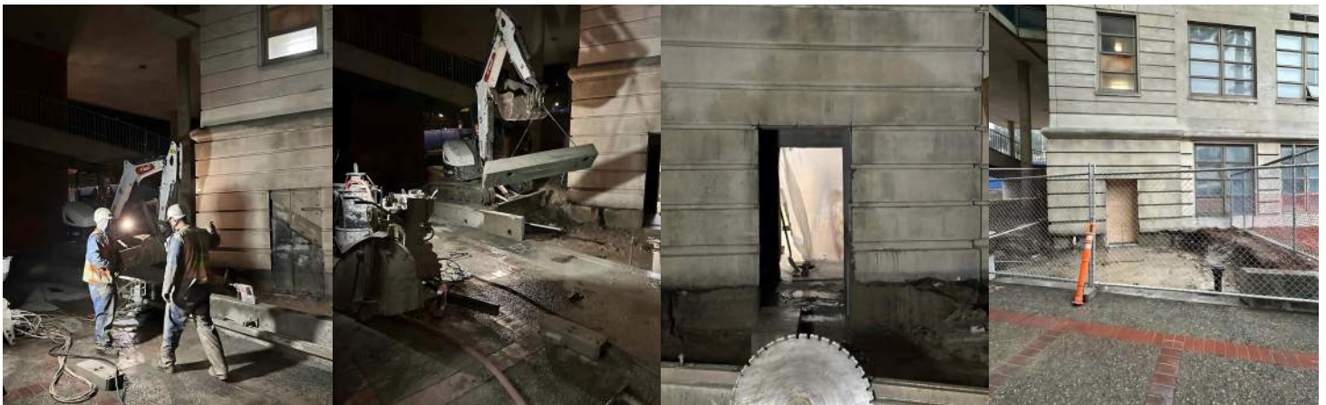
Lewis Hall Ground Floor Before and After New Sawcut Opening