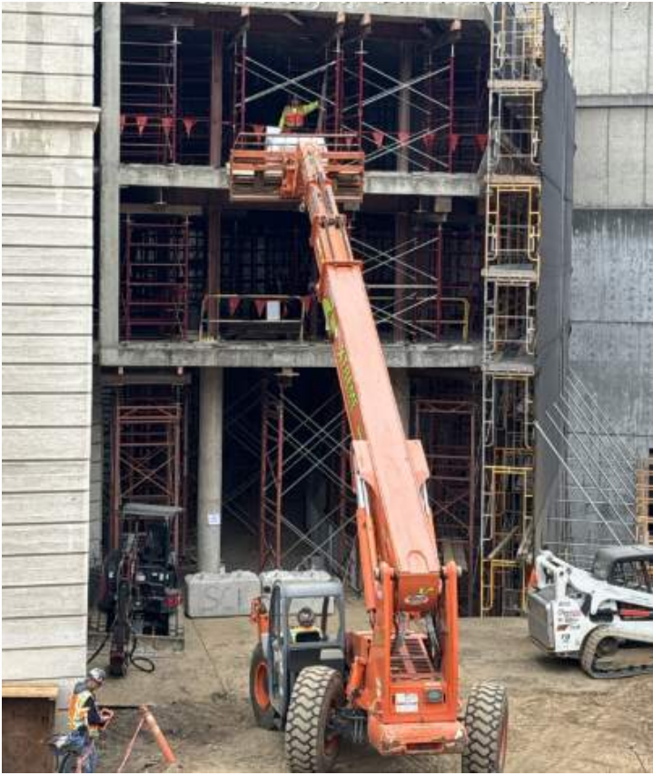
Structural Demolition of the Link - Progress Photo #1