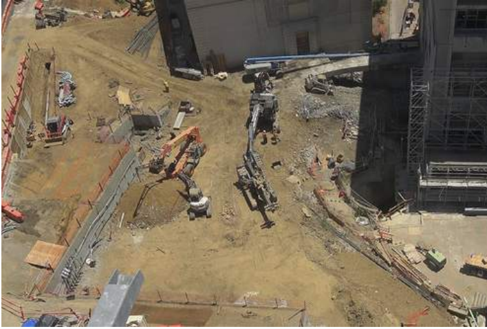
Overhead View of our Project Site