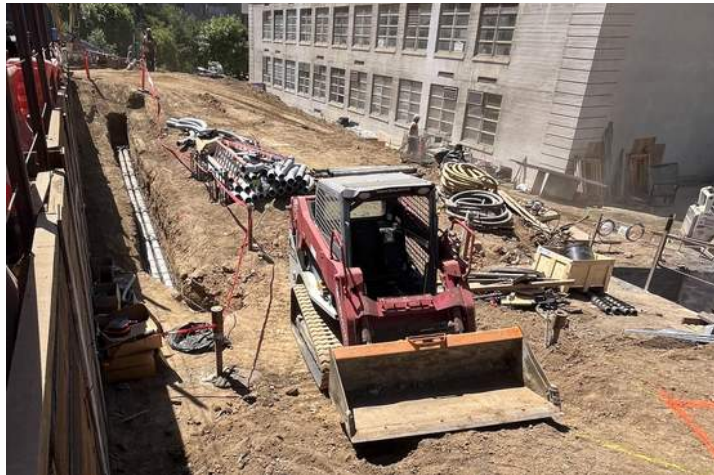
Temporary Power Installation Progress