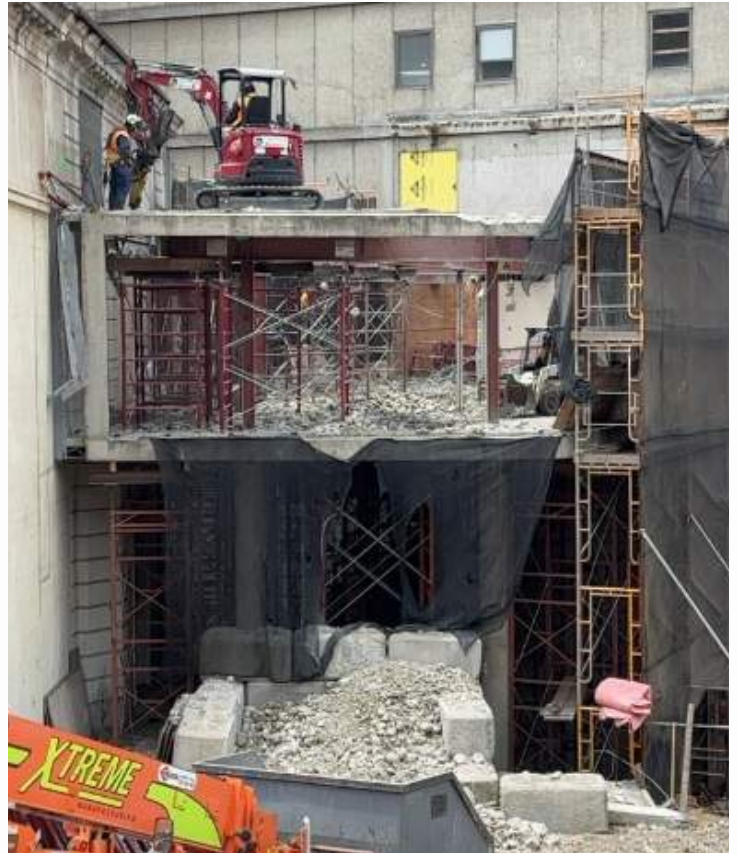
Structural Demolition of the Link - Progress Photo #2