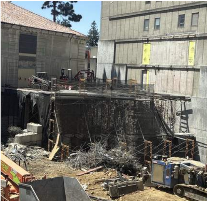
Structural Demolition of the Link - Progress Photo #3