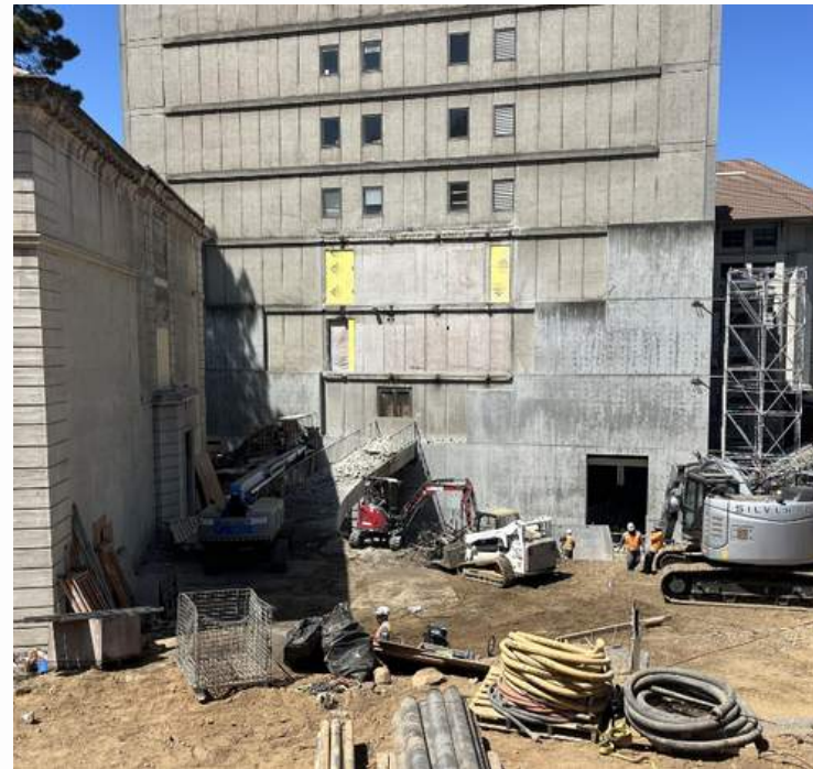
Structural Demolition of the Link - Progress Photo #4