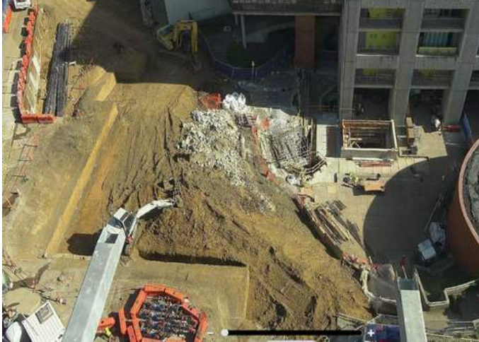
Overhead Photo of our Site Prior to Test Nail Installation