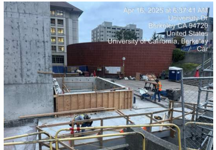
Progress at the New Air Intake