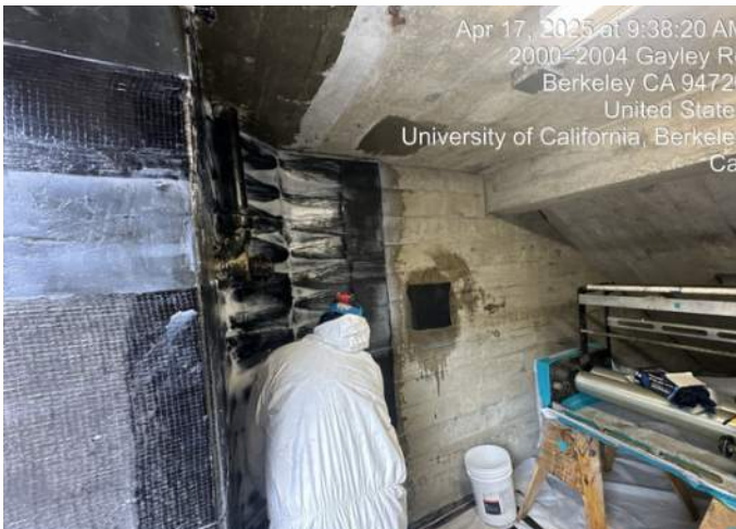
Applying FRP Layers at the New Lewis Hall Opening