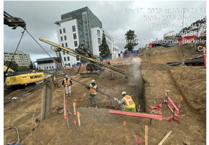
Drilling Test Nails to Prepare for Installing Soil Nails